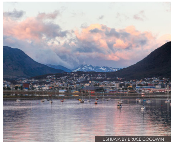
USHUAIA BY BRUCE GOODWIN