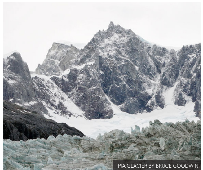
PIA GLACIER BY BRUCE GOODWIN