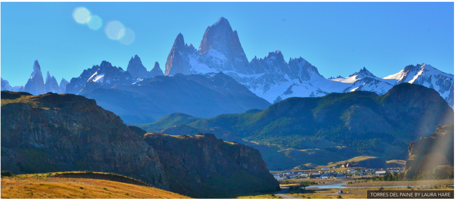
TORRES DEL PAINE